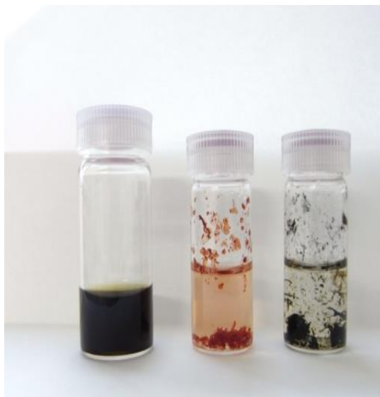
Figure 3. Super-polyphenols can catch the iron(III) ions of the Fe(III)-nta solution, removing the iron(III) ion from the solution

Left: solution of Fe(III)-(nta) chelate (Nishida, 2012b)