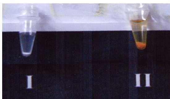
Figure 1. I. Zinc (II) chloride (10 \mu l, 1 M) was added to the A \beta (1-40) solution (100 \mu l, 0.25mg/ mL). II. Fe 2 (HPTP)Cl 4 ClO 4 solution (50 \mu l, 2 mg/mL) was added to the solution I. Brown precipitates occurred immediately upon the addition of Fe 2 (HPTP)Cl 4 ClO 4 solution.

In addition to the above, we also found that zinc(II) ion leads to the iron deposition formation (see Figure 1) when the binuclear iron(III) complex with an alkoxo-bridge [Fe 2 (HPTP)Cl 4 ] + ion was added to the solution containing A \beta (1-40) and zinc(II), where H(HPTP) represents N,N,N',N'-tetrakis(2-pyridylmethyl)-1,3-diamino-2-propanol (Nishino et al. 1999). It should be noted that much iron (III) and zinc (II) ions are included in the brown deposition in Figure 1.