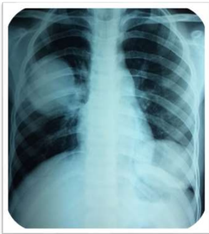
Figure2: Bilateral giant pulmonary hydatid cysts