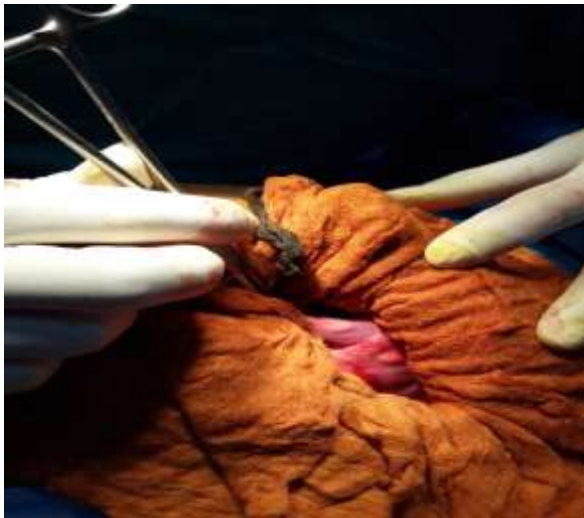
Figure 7: Cyst delivered for excision