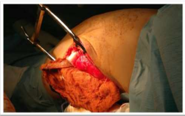
Figure 6 : Strict isolation of the cyst to prevent any potential seeding