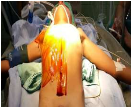
Figure 5: Cyst isolation for evacuation