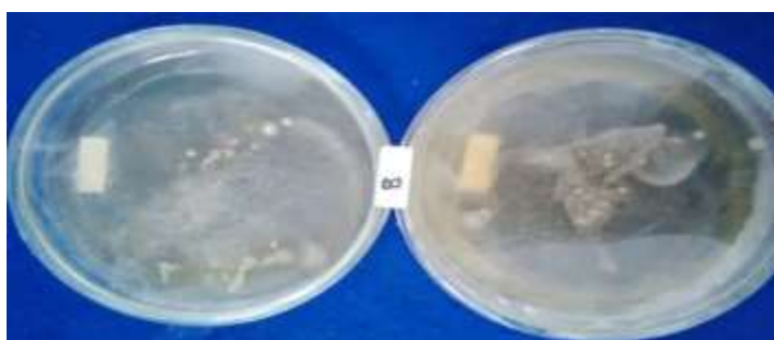
Figure 1: Growth of Entomopathogenic Fungal Colonies Isolated from Soil on PDA Medium

a = hyphae and mycelial growths, b = soil samples