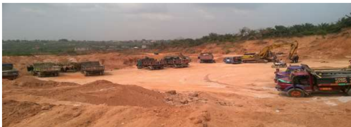
Figure 1: Oba Excavation Site (Photo shot by the researchers), date taken: 02/02/2017

Oba is a town in Anambra State, Nigeria, which lies approximately 7 kilometres south of Onitsha along the old Owerri-Onitsha Trunk A Road. Oba is located 6°4'N 6°50'E/ 6.067°N 6.833°E ( https://en.m.wikipedia.org/wiki/Oba,_Anambra , Date Accessed, 14/11/2019)