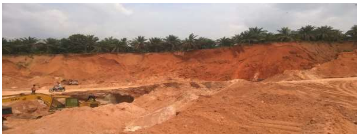
Figure 2: Oba Excavation Site, date taken: 02/02/2017