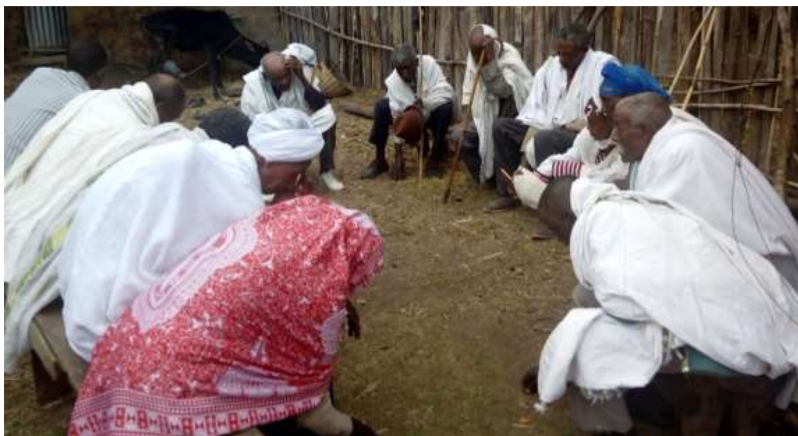
Figure 4: Blessing during Guddifacha ceremony (photo taken during field observation, April 2019). Therefore, the above showed that, as women have a crucial role in Gada institution in general and guddifacha in particular. For example Jaartii Cifree and haadha siiqqee play great role in advising, counseling, blessing and they have high status and respect among the Oromo people. This implies that Gada system considers the equality of women with men in guddifacha ceremony.