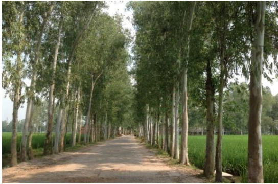
Figure 2: Road Forestry in the district