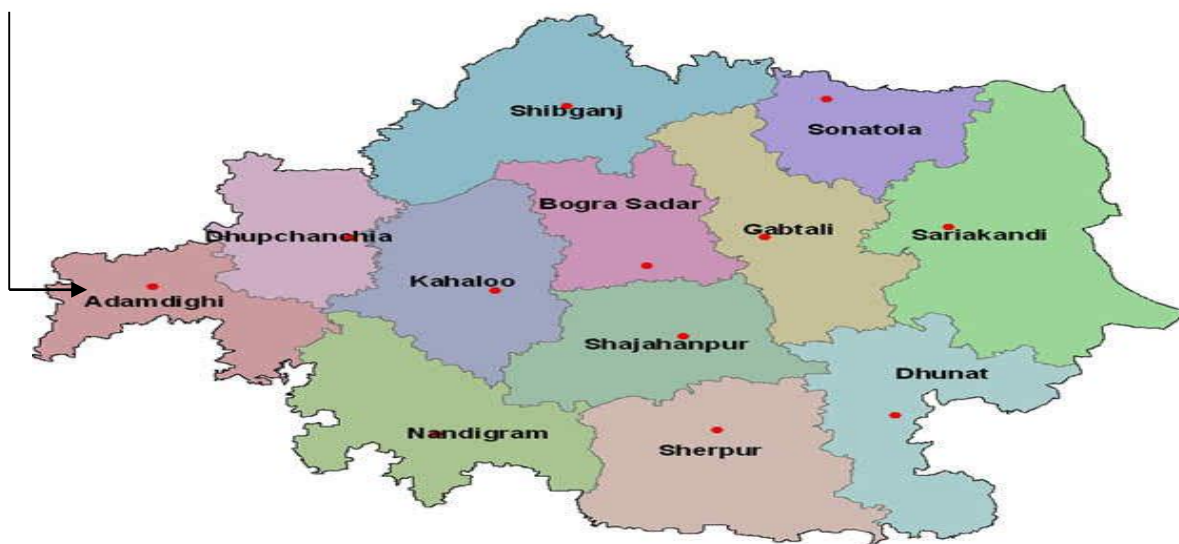
Figure 1: Map of the study area in Bogra district, Bangladesh