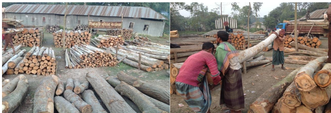
Figure 8: Accumulated timber waiting for transfer to their desired place