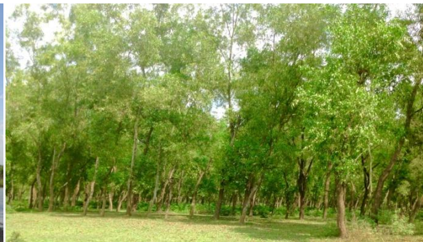
Figure 5: Forestry in new growing land in the river Jamuna