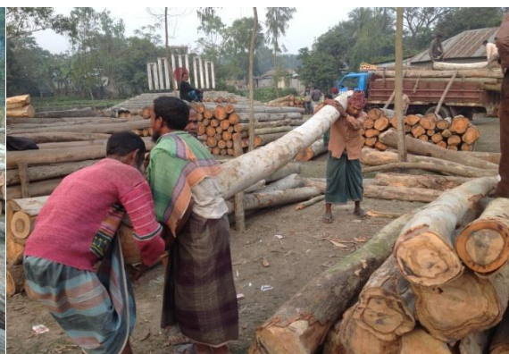
Figure 9: Ensuring employment in rural economy

By the help of forest department, a remarkable number of tree farming farms (nursery) have grown up all through the district of Bogra for the future development of social forestry in private enterprise which is shown in Table 3.