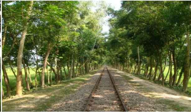
Figure 3: Rail way Forestry in inter district