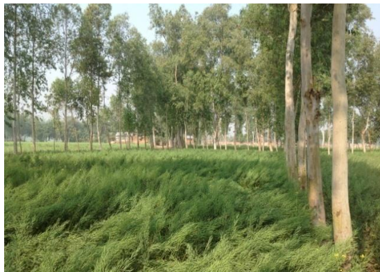
Figure 6: Forestry by the side of agriculture farm