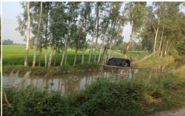
Figure 7: forestry beside drain and water bodies