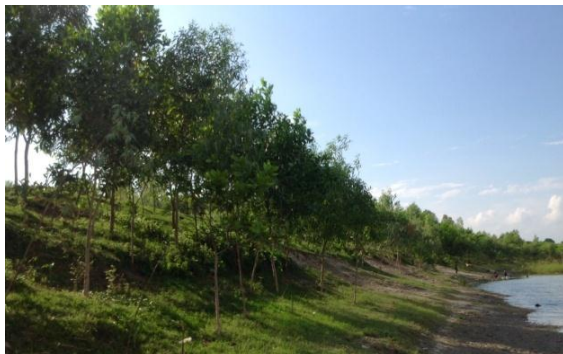
Figure 4: Riverside Forestry on embankment