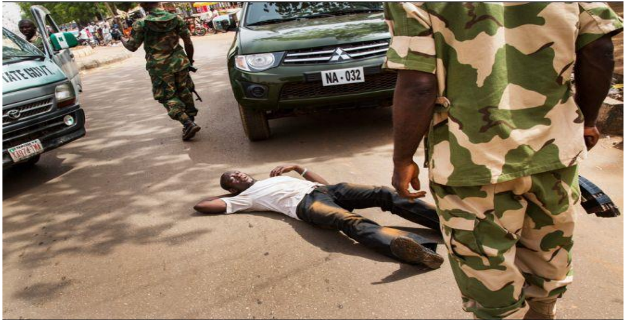
Nigerian Army forces man a checkpoint to protect Sunday Christian prayer services in Sokoto, Nigeria on April 14, 2013, where less than 5 percent of the population is Christian.

As West Africa's most powerful pre-colonial state, it is a source of great pride. But for some, its defeat by the British in 1903 and subsequent dealings with colonial and post-colonial states mean the caliphate is tarnished with the corrupting influence of secular political power. The impact of colonial rule was paradoxical. While policies of indirect rule allowed traditional authorities, principally the Sultan of Sokoto, to continue to expand their power, that power was also circumscribed by the British.