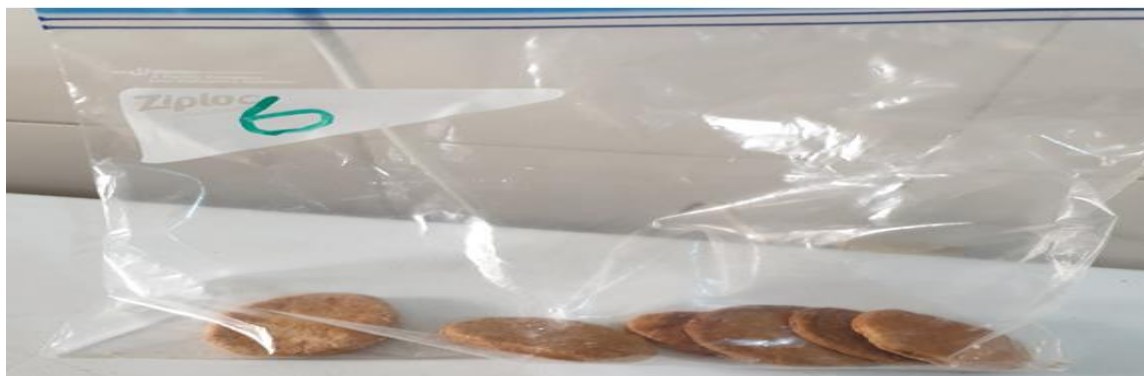
Figure 2: Production of cookies at different formulations