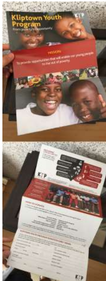
Figure 4: Flyers of KYP

Helpers from overseas countries visit Soweto annually to contribute their services. In 2015, KYP had several students from the University of Pennsylvania visit and assist while also receiving course credit. This group of students helped KYP design promotional flyers (see Figure 4), and develop an official KYP website (see Figure 5).