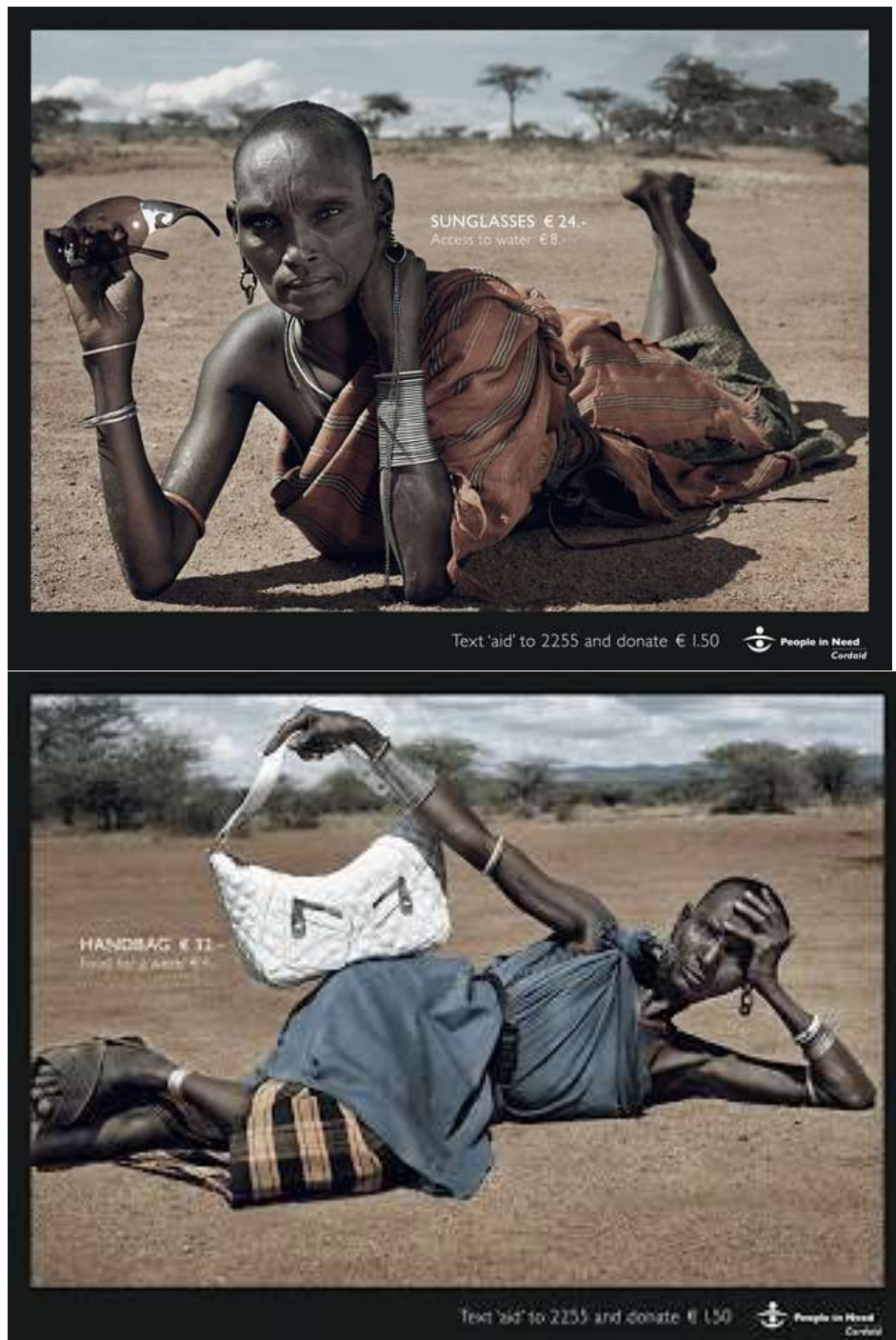
Figure 8. A South African print ad campaign example