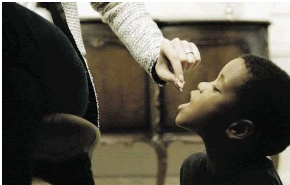
Figure 7. The Hungry Child advertisement

Generally, we can see that South African NGOs' advertising is more freestyle than that of Chinese NGOs. And yet, with South African NGOs there remain lingering memories and resentment of apartheid. For example, the "Hungry Child" ad (see Figure 7), which features a white person feeding a "tidbit" to a black child, sparked a racial storm when it was released. This ad failed to appeal to the targeted audience for obvious reasons. It didn't help that the child seemed to be seated in a position similar to a dog when it is begging for table scraps.