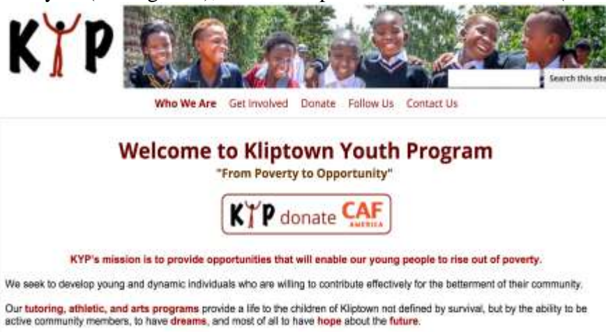
Figure 5. KYP official website

Helpers from overseas countries visit Soweto annually to contribute their services. In 2015, KYP had several students from the University of Pennsylvania visit and assist while also receiving course credit. This group of students helped KYP design promotional flyers (see Figure 4), and develop an official KYP website (see Figure 5).