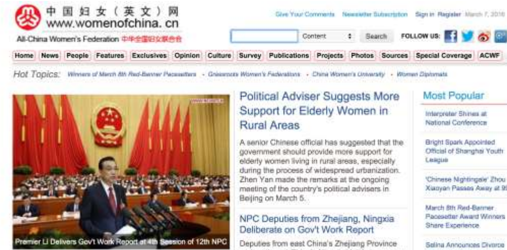
Figure 6. Homepage of the All-China Women's Federation

Compared to South African NGOs, Chinese NGOs are imbued with strong political characteristics. Consider the All-China Women's Federation as an example; its official website is populated with the latest political events in China, the 12 th National People's Congress (see Figure 6).