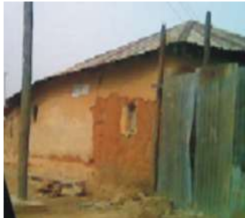
Figure 1I showing the peeling-off of Portland Cement Coat on traditional earth building at the study area.