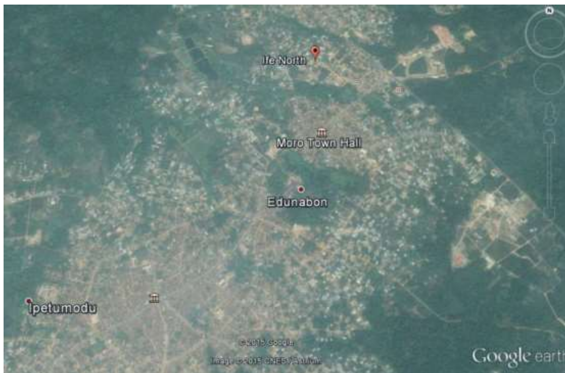
Figure. 1 Showing the map location

traditional and vernacular houses. Origbo rural communities have undergone considerable growth in the recent time as influxes of people were necessitate by spontaneous development such as advent of permanent site of distance learning programme by Obafemi Awolowo University as well as corresponding increase of commercial activities. House-form pattern commonly featured at Origbo community are typical courtyard housed and vernacular dwelling built from local materials. Many of those houses are still in their normal natural form while some of them have been plastered with cement, either total plastering or lower part of the building, the roofing element is corrugated sheet, indigenous thatched system of roofing has been substituted with corrugated due to technological innovation and improvement over the thatch.