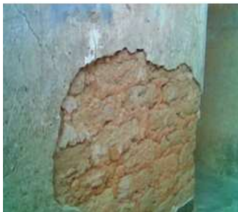
Figure III showing the weakness of Portland Cement Coat on traditional earth building.