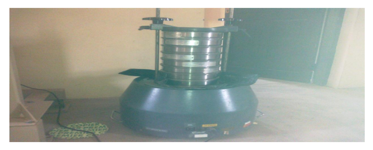
Plate 2: The Endoctts sieving machine model EFL used for the grain size distribution analysis