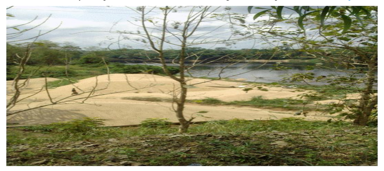
Plate 1: An aerial outcrop view of silica sand deposit on River Katsina-Ala