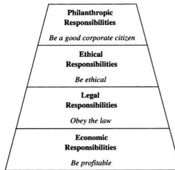
Figure 1. Carroll's pyramid of corporate social responsibility (Schwartz and Carroll 2003: 504)

CS can only be achieved by adopting ethical values and corporate governance principles. Having ethical values in a corporation enables integrity and confidentiality, which secure being in line with regulations and laws, and prevention of fraud such as insider trading. Lack of corporate governance increases the chance of failure in business, thus corporate sustainability is endangered under conditions that are not strictly following ethical and corporate governance principles. Additionally, developments in corporate governance reporting requirements offer opportunities for the appropriation of risk and its management (Spira and Page, 2003).