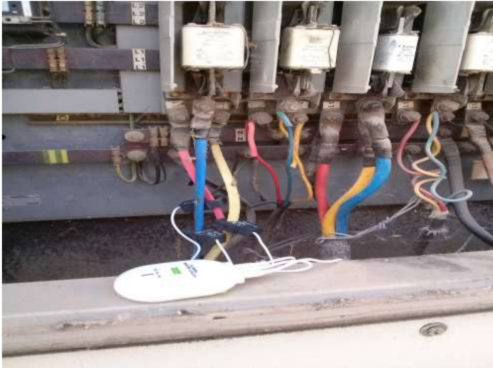
Fig 3: Wireless Energy Monitoring Device Installed at Point of Supply in Office Building.