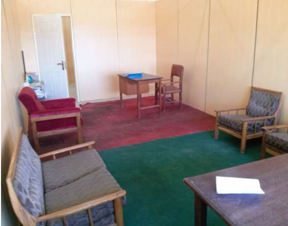
. Fig 2: Typical Interior of Office Studied.