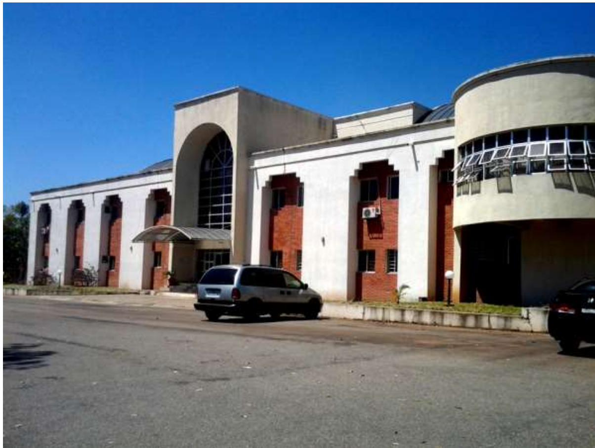
Fig 1: Typical Administrative Building Studied (Building ID: NIPSS ADMIN).

The data thus obtained from this simulation was correlated with that obtained by real-time measurement of energy consumption of the building under research. The result of this research will key into the proposed Building Energy Efficiency Guideline (BEEG) for buildings in Nigeria (See Fig 1 and 2).