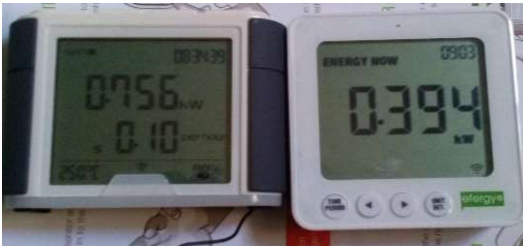
Fig 4: Wireless Energy Monitoring Devices Indicating Readings.