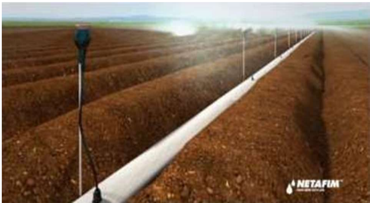
Figure 2. Risers and Sprinklers connected Lateral. (Ighrakpata et al., 2019)