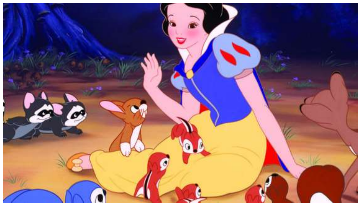
Figure 10. Disney princess, Snow White (Fairy Tale) [172,173]. In the time that Snow White was released it was a common for the majority of women desired to have blush in their faces like her. Rouge originated as a thick paste, and was made from a range of things: from strawberries, to red fruits and vegetable juices, to the powder of finely crushed ochre. As nouns the difference between blush and rouge. is that blush being an act of blushing or blush can be the collective noun for a group of boys while rouge is red or pink makeup to add color to the cheeks; blusher. Blushers, those versatile successors to rouge, help light up a complexion and accent face structure and best features.

Rouge, blush, or blusher is cheek coloring to bring out the color in the cheeks and make the cheekbones appear more defined. Blush is having a major moment, graduating from makeup bag staple to a starring role in almost every red-carpet beauty look. Rouge comes in powder, cream, and liquid forms. Different blush colors are used to compliment different skin tones. The ancient Egyptians were the first to incorporate blush into their beauty rituals. The Middle Ages saw a drop in the use of blush, as red cheeks were associated with prostitutes. During the 1500s to the 1700s, blush was made with toxic chemicals. Starting in the 1900s, as America became industrialized, blush began to be mass produced and became much safer to use [98-100].