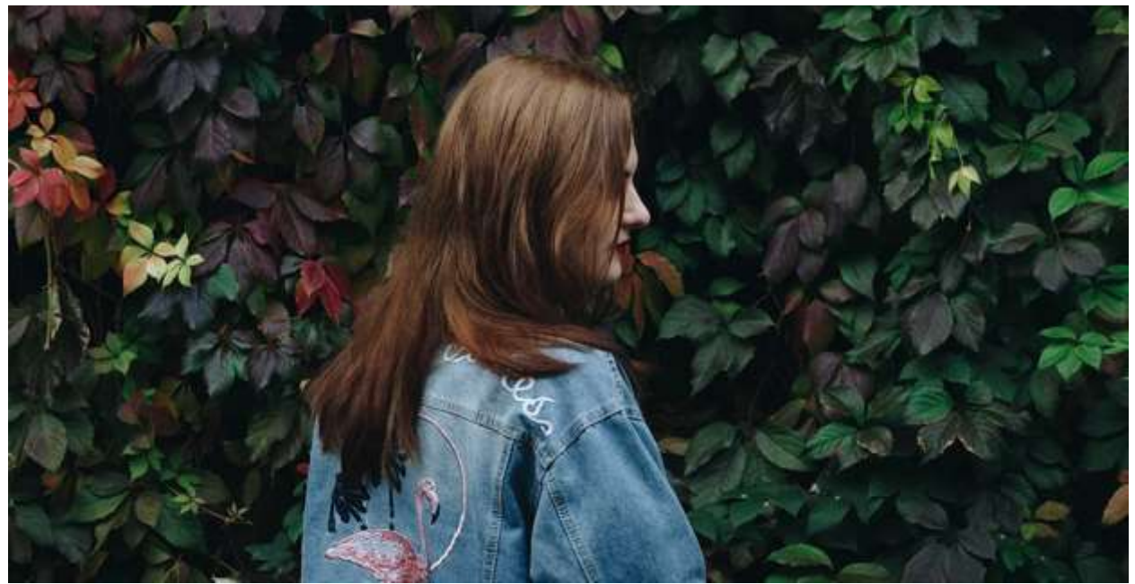
Figure 3. How Do Plant Stem Cells Help Hair Growth? [69,70]. Plant stem cells possess similar genetic factors as human stem cells and can be used to influence the function of certain cells in our skin and hair follicles. Active plant stem cells work to increase the lifespan of hair follicles so that hair can remain in the anagen phase of the hair growth cycle for a longer period of time. Another hair-growth benefit of Asparagus Stem Cells is their ability to block the most common hair-killing hormone, DHT. High levels of DHT, as well as sensitivity to the hormone, are known for causing most male-pattern baldness and even female alopecia. Asparagus Stem Cells can aid the receptors in the skin to block the intrusion of DHT, and therefore minimizing the hair loss caused by it.

effective beauty products for their needs – and value is determined first on efficacy. On the face of it, reaching today's consumers and winning their buy for the long term seems an ever more daunting proposition, but their quest and hunger for ever more efficacious and intriguing products actually translates to more opportunities to innovate for new unmet needs. Turning innovation into success, though, will truly depend on an open and honest conversation with consumers – listening to their needs and being as clear as possible about claims and the potential for any given product. Brand owners must convey the value of new ingredients, formulas and products through clear language, with explanations of benefits based on scientific studies or other trials. Backing good ingredients and products by developing smart marketing campaigns that are able to convey appropriate expectations from the use of products will foster a significant connection with consumers – and that translates to the growth of business.