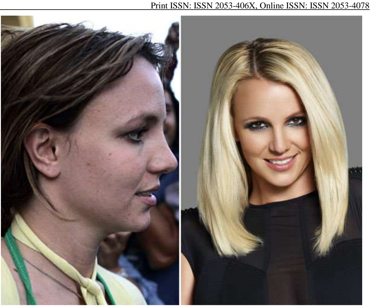
Figure 9. Pimpled and no pimpled Britney Spears [185,186]. At glamorous, Hollywood events, the ".... baby one more time" star Britney Spears' skin seems flawless, but in reality, this is far from the truth: redness, pimples, rashes – the singer knows all of these problems too well, first hand. However, Girls and women often use concealer or foundation to cover up their pimples. This makes them feel more comfortable in public. Young men sometimes use subtle foundation, powder and concealer as well.