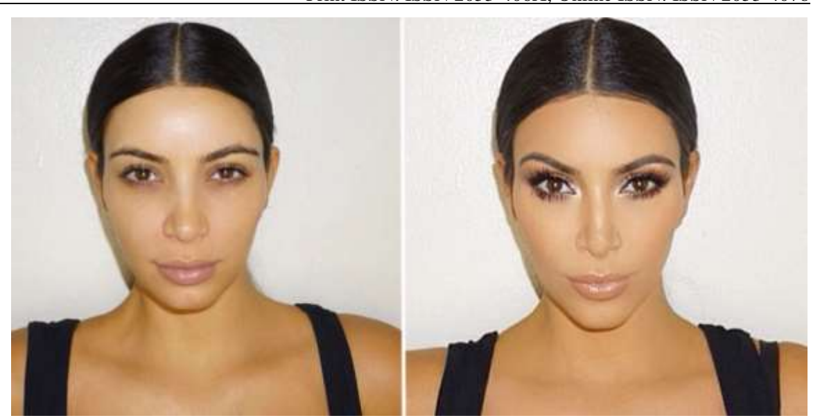
Figure 14. Contouring [182]. Contouring is the newest makeup craze that people just can't get enough of! This trend, made famous by none other than the Kardashian sisters, was created to make your face appear slimmer and more sculpted. The basic premise of it is to highlight the areas of face that someone would like to bring out, while shading in the parts she wants to make thinner.

European Journal of Biology and Medical Science Research Vol.7, No.4, pp.22-64, October 2019 Published by ECRTD- UK Print ISSN: ISSN 2053-406X, Online ISSN: ISSN 2053-4078