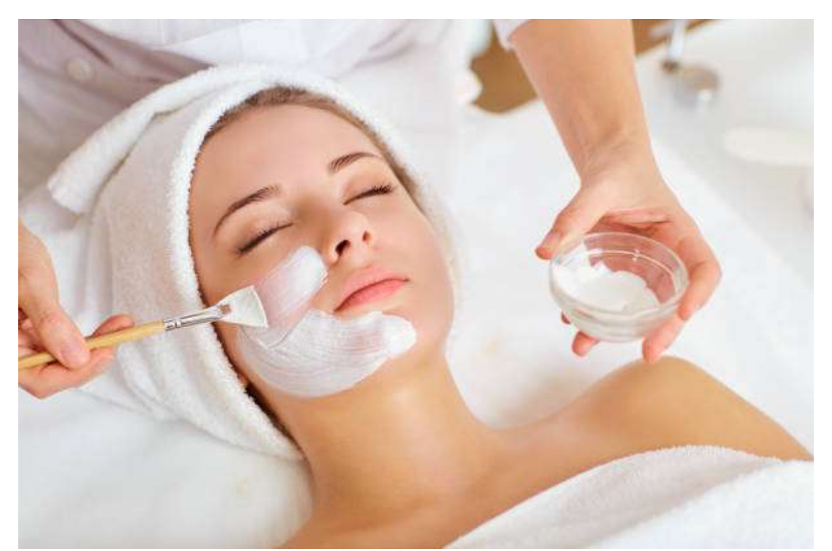
Figure 12. Facial Treatment [177-180]. Facial masks are the most prevalent cosmetic products utilized for skin rejuvenation. Facial masks are divided into four groups: (a) sheet masks; (b) peel-off masks; (c) rinse-off masks; and (d) hydrogels. Each of these has some advantages for specific skin types based on the ingredients used. Peel-off facial masks are known for their unique characteristics inherent to the use of film-forming polymers that, after

Facial masks are treatments applied to the skin and then removed. Typically, they are applied to a dry, cleansed face, avoiding the eyes and lips. Clay-based masks use kaolin clay or fuller's earth to transport essential oils and chemicals to the skin, and are typically left on until completely dry. As the clay dries, it absorbs excess oil and dirt from the surface of the skin and may help to clear blocked pores or draw comedones to the surface. Because of its drying actions, clay-based masks should only be used on oily skins. Peel masks are typically gel-like in consistency, and contain acids or exfoliating agents to help exfoliate the skin, along with other ingredients to hydrate, discourage wrinkles, or treat uneven skin tone. They are left on to dry and then gently peeled off. They should be avoided by people with dry or sensitive skin, as they tend to be very drying. Sheet masks are a relatively new product that are becoming extremely popular in Asia. Sheet masks consist of a thin cotton or fiber sheet with holes cut out for the eyes and lips and cut to fit the contours of the face, onto which serums and skin treatments are brushed in a thin layer; the sheets may be soaked in the treatment. Masks are available to suit almost all skin types and skin complaints. Sheet masks are quicker, less messy, and require no specialized knowledge or equipment for their use compared to other types of face masks, but they may be difficult to find and purchase outside Asia [116-118].