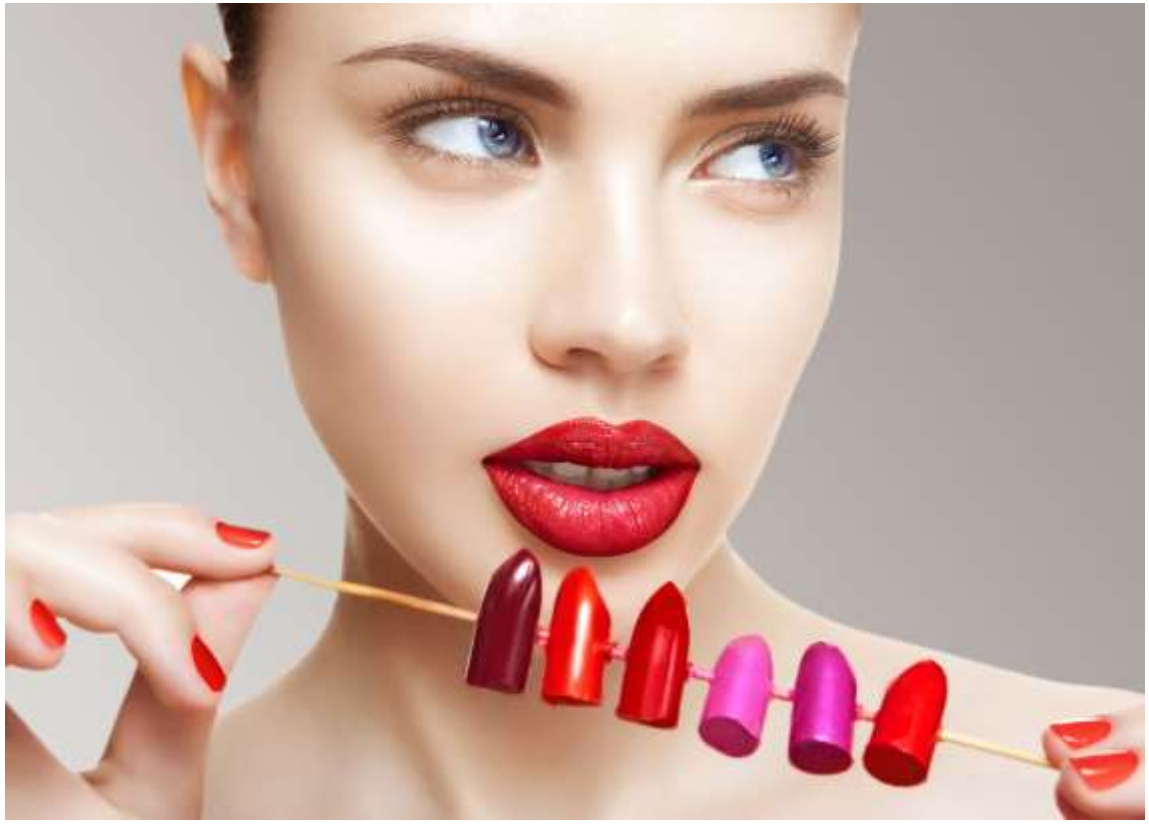
Figure 7. Lip Color [169,170], [181]. Makeup artists and advertisements for cosmetics often claim that lip color can influence facial skin's apparent lightness. Currently, we do not have scientific evidence to either support or deny these claims. The luminance contrast between facial features and facial skin is greater in women than in men, and women's use of make-up enhances this contrast. In black-and-white photographs, increased luminance contrast enhances femininity and attractiveness in women's faces, but reduces masculinity and attractiveness in men's faces. In Caucasians, much of the contrast between the lips and facial

Lips makeup- Lipstick, lip gloss, lip liner, lip plumper, lip balm, lip stain, lip conditioner, lip primer, lip boosters, and lip butters. Lipsticks are intended to add color and texture to the lips and often come in a wide range of colors, as well as finishes such as matte, satin, gloss and luster. Lip stains have a water or gel base and may contain alcohol to help the product stay on leaving a matte look. They temporarily saturate the lips with a dye. Usually designed to be waterproof, the product may come with an applicator brush, directly through the applicator, rollerball, or could be applied with a finger. Lip glosses are intended to add shine to the lips and may add a tint of color, as well as being scented or flavored for a pop of fun. Lip balms are most often used to moisturize, tint, and protect the lips. Some brands contain sunscreen. Using a priming lip product such as lip balm or chapstick can prevent chapped lips [6-8], [73].