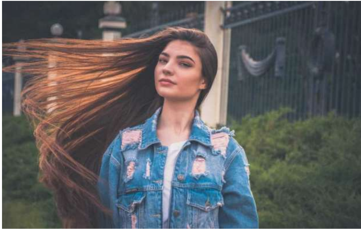
Figure 13. Woman with long beautiful hair [187,188]. The main purpose of shampoo is to remove dirt and oil from the surface of the hair fibers and the scalp, while the main purpose of conditioner is to ensure that the hair is smooth for combing. Shampoos typically contain a primary and a secondary surfactant for thorough cleaning, a viscosity builder, a solvent, conditioning agents, pH adjuster and other non-essential components such as fragrance and color for commercial appeal. Conditioners usually contain silicone polymers to increase shine and soften hair, cationic polymers such as quaternary nitrogen compounds to reduce static electricity, bridging agents to increase absorption, viscosity builder, pH adjuster and components for commercial appeal.

Shampoos are used primarily to clean the scalp of dirt and other environmental pollutants, sebum, sweat, desquamated corneocytes (scales), and other greasy residues including previously applied hair care products such as oils, lotions and sprays. It is easy to formulate a shampoo which will remove all of the sebum and dirt from the hair and scalp, but this will leave the hair, frizzy, dry, unmanageable and unattractive. Shampoo now is also supposed to have a secondary function which serves to condition and beautify hair and to soothe the irritated scalp skin in conditions like seborrheic dermatitis. The challenge is to remove just enough sebum to allow the hair to appear clean and leave behind enough conditioning agents to leave the hair soft, shiny and manageable. This balancing act between good cleaning and beautifying the hair is an art achieved by mixing various ingredients in the correct proportion in the shampoo preparation. The modern advances in chemistry and technology have made it possible to replace the soap bases with complex formulation which contain cleansing agents, conditioning agents along with functional additives, preservative, aesthetic additives and sometimes even medically active ingredients [121-125].