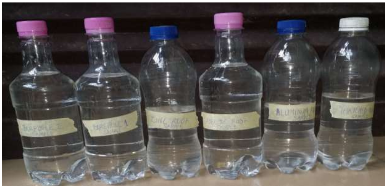
Plate 1. Water samples harvested from borehole and rain water.

The water samples were collected using well-labelled plastic bottles. This is because plastic do not dissociate into water thereby reducing chemical interference in the analyses. The plastic container used for the collection of rainwater samples were set under the roofing sheets so that there will be free flow of the rainwater into the containers. The samples were collected from four different roofing sheets (Zinc, Aluminum, Asbestos and Thatched) so as to be able to observe differences in the water quality. In view of the unpredictable condition of rain, collections of sample were flexible and were done while rain was falling. Before collection, the plastic bottles and containers were first rinsed with distilled water before water samples were collected. This was done to avoid contamination from previous water content.