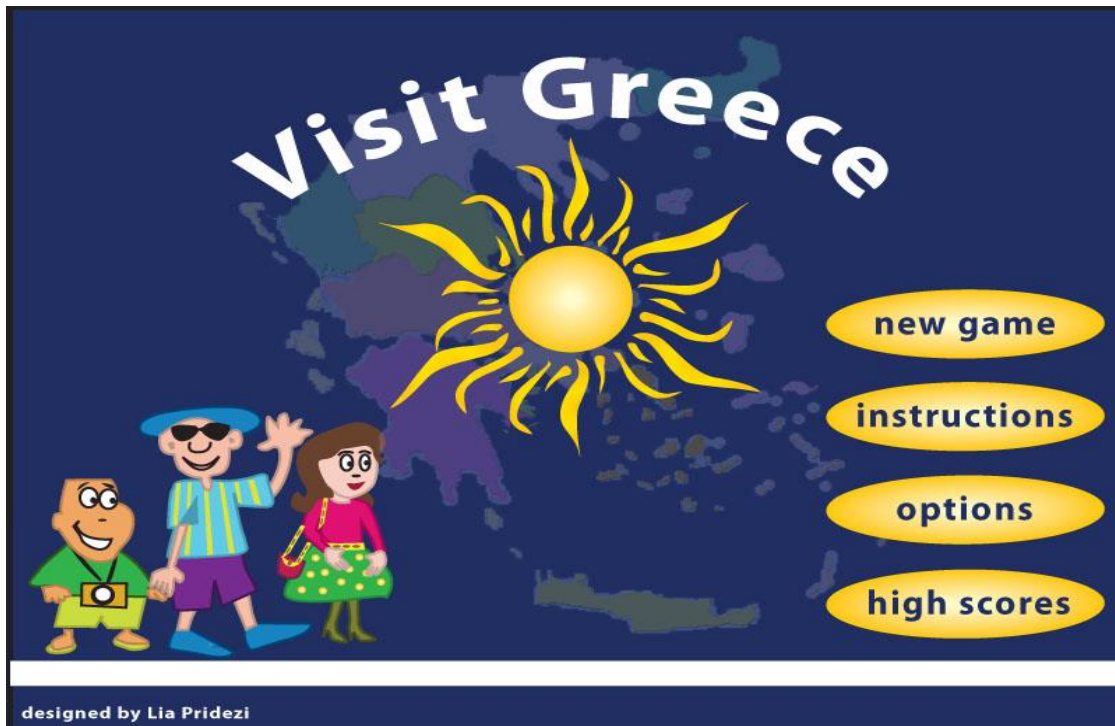
Figure 2: Main game screen