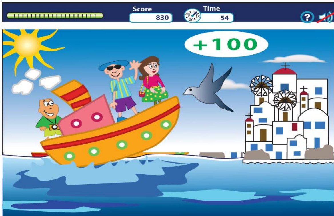
Figure 4: The trip to Greek islands

It is worth noting that the constant adaptation to new facts and circumstances is crucial for the survival of tourism businesses. In an increasingly competitive environment, the new tourism products should gain added value and be able to satisfy the customers in order to gain their trust and loyalty. Moreover, the expectations are not the same for all tourists and are always changing over time. This finding requires constant evaluation of the impact of these changes and strategy review. Furthermore, the effective implementation of good practices and the successful and proper use of new technologies and visual communication tools are required. It is obvious that traditional methods of communication are insufficient, while modern ones are on the way and should replace the old, such as road tours, video surround, virtual reality, interactive digital communication and online games. The online communication is offered as a wonderful tool of visual communication, marketing and promotion of products and services. It is one of the best practices in order to raise emotions, “steal” the impression and the prospective visitors further aiming at the intense desire to visit and live the "dream" offered in their virtual tours.