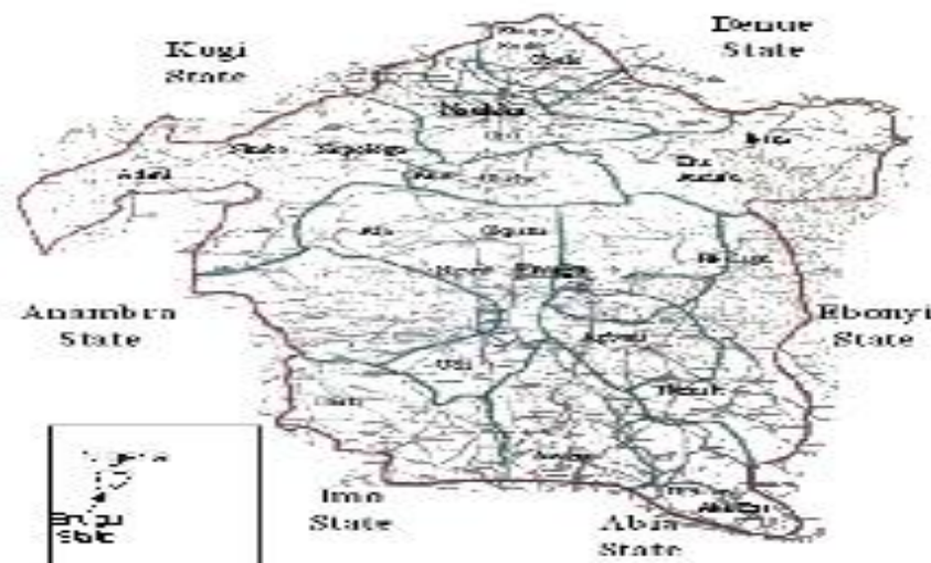
Figure 1 Map of Enugu state showing other neighboring states

Enugu is located in a tropical rain forest zone with a derived savannah.