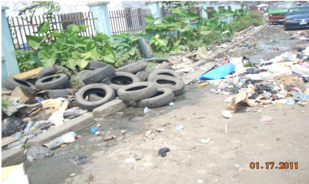
Plate 4.3: A Drain Blocked with Waste and on the Street at Coronation Layout.