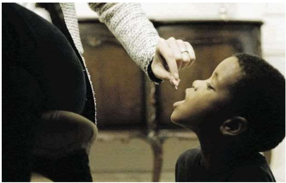
Figure 7. The Hungry Child advertisement

Generally, we can see that South African NGOs' advertising is more freestyle than that of Chinese NGOs. And yet, with South African NGOs there remain lingering memories and resentment of apartheid. For example, the "Hungry Child" ad (see Figure 7), which features a white person feeding a "tidbit" to a black child, sparked a racial storm when it was released. This ad failed to appeal to the targeted audience for obvious reasons. It didn't help that the child seemed to be seated in a position similar to a dog when it is begging for table scraps.