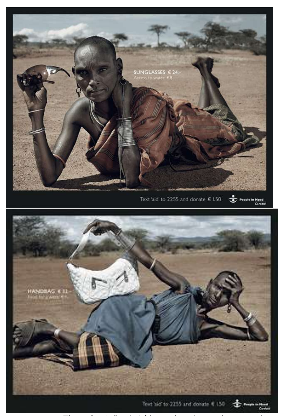
Figure 8. A South African print ad campaign example