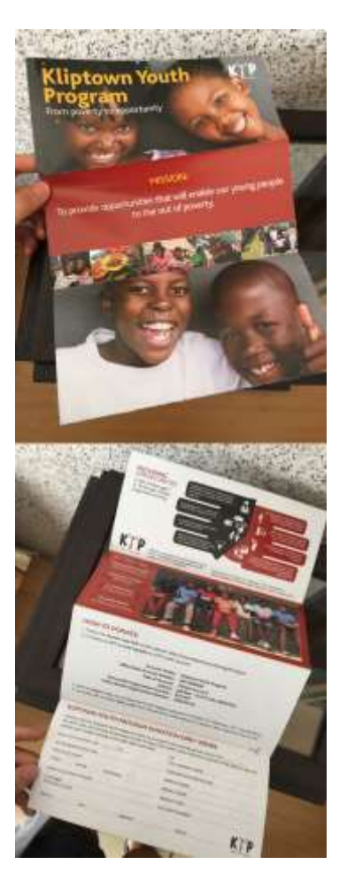
Figure 4: Flyers of KYP

Helpers from overseas countries visit Soweto annually to contribute their services. In 2015, KYP had several students from the University of Pennsylvania visit and assist while also receiving course credit. This group of students helped KYP design promotional flyers (see Figure 4), and develop an official KYP website (see Figure 5).