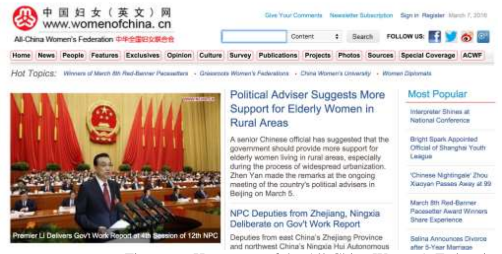
Figure 6. Homepage of the All-China Women's Federation

Compared to South African NGOs, Chinese NGOs are imbued with strong political characteristics. Consider the All-China Women's Federation as an example; its official website is populated with the latest political events in China, the 12<sup>th</sup> National People's Congress (see Figure 6).