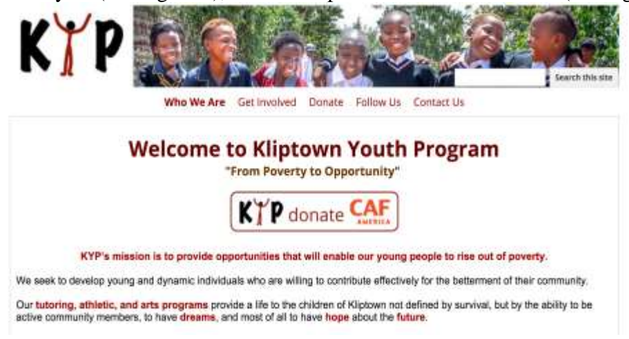
Figure 5. KYP official website

Helpers from overseas countries visit Soweto annually to contribute their services. In 2015, KYP had several students from the University of Pennsylvania visit and assist while also receiving course credit. This group of students helped KYP design promotional flyers (see Figure 4), and develop an official KYP website (see Figure 5).