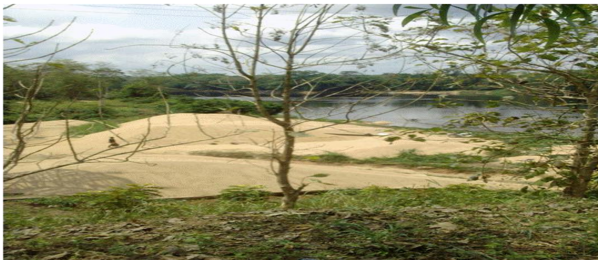
Plate 1: An aerial outcrop view of silica sand deposit on River Katsina-Ala