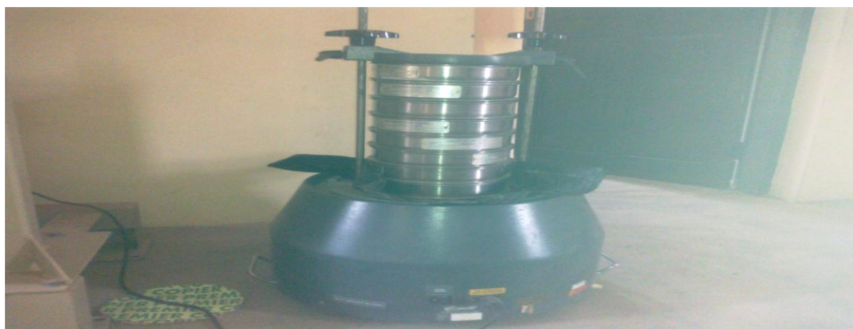
Plate 2: The Endoctts sieving machine model EFL used for the grain size distribution analysis