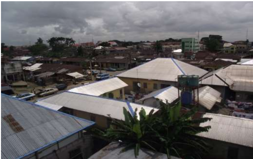
Figure 1.1: View of Old Port Harcourt Township

The study showed that over half (54.9%) of the residents rated general neighbourhood conditions poor while only 18.6% of the residents rated aesthetic conditions poor (See Figure 1). The study showed that 48.2% of the residents rated solid waste collection and disposal poor. These results showed that conditions are poor.