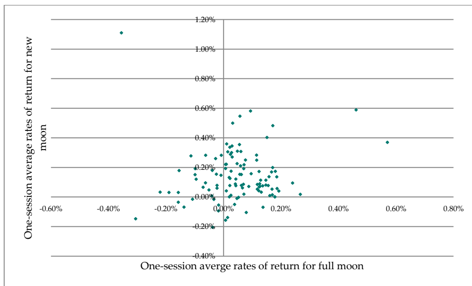
Figure 2. One-session average rates of return for analyzed indices and commodities – Regime 2.