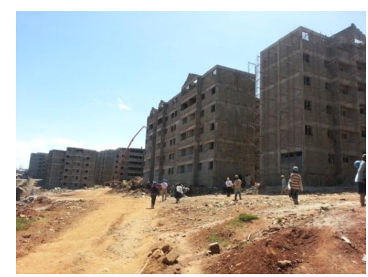
Plate II: House types at Decanting site for Kibera settlement