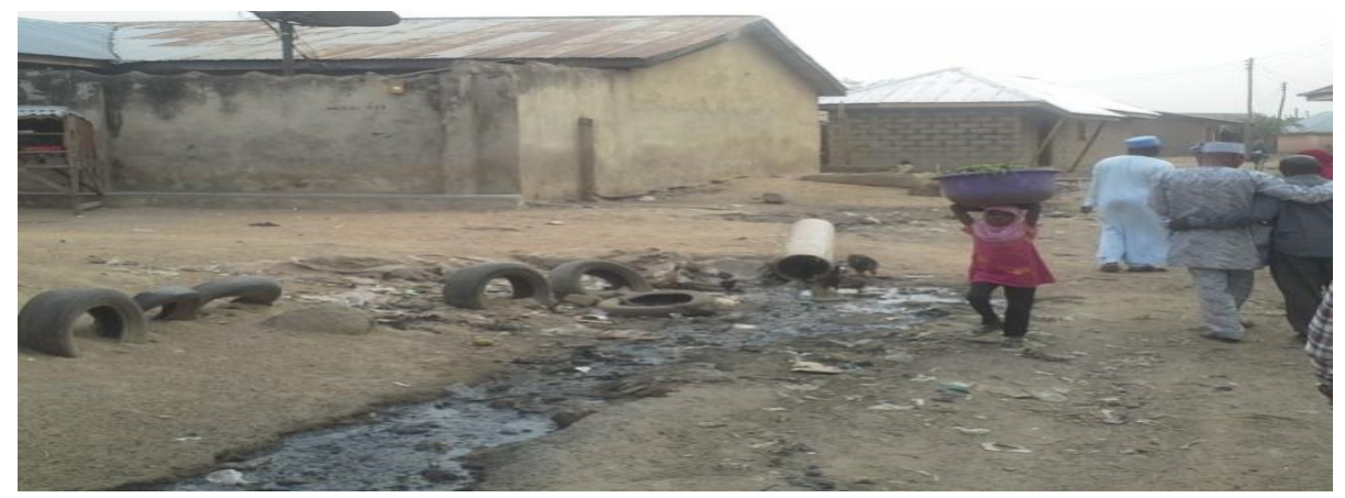
Plate I: Unplanned drainage cutting through the road Barkin-Sale area of Niger State, Nigeria

The demand for land in the urban centres in Nigeria is one that is quite high and the land cost in Nigeria is one that oftentimes does not favour the poor, (Anugwom, 2001). Whenever there is demand for land as the cities grow the area of attraction is usually the urban poor settlements. The Governments usually invokes "overriding public interest" clauses to enable it claim the land where the poor live to develop. This action usually forces the urban poor to seek new lands or in some cases revolt against the system. Their housing need is always a challenge for those involved in city planning especially when it involves resettlement, upgrading, relocation or creation of new housing schemes. The housing schemes provided in the name of housing the urban poor never get to them or in some cases they just meet their needs.