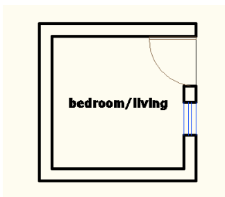
Figure 1.0: Example of Floor Plan of a housing Floor Plan occupied