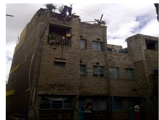
Plate IV : Finished House type at Kambi Moto settlement construction at Kambi Moto Settlement