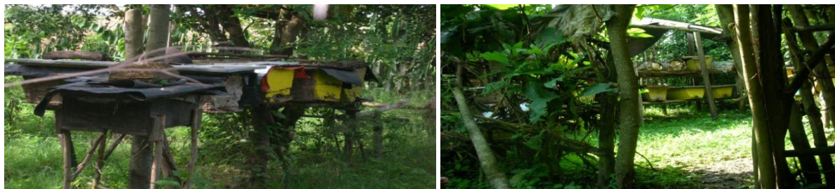
Figure 1, bee management before intervention and figure 2, management after intervention

Attitude of the beekeepers towards watershed integrated beekeeping technology is a very important phenomenon to take into consideration for sustainable adoption of improved beekeeping in watershed conservation. Farmers field visiting days facilitated and asked their response on the watershed status and they assured that they have developed awareness on the value of beekeeping for conservation and income generation as the result they have brought relatively better attitudinal change towards improved beekeeping technology and planting of different bee forage plants after this research demonstration.