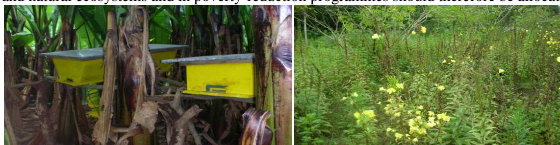
Figure 1, Apiary before intervention and figure 2, apiaries after technology awareness

technological support to fully exploit the great potential of beekeeping in the conservation of forest and natural ecosystems and in poverty-reduction programmes should therefore be allocated.