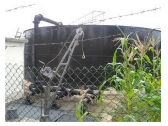
Figure 3: First stage of sedimentation tank

Published by European Centre for Research Training and Development UK (www.eajournals.org)