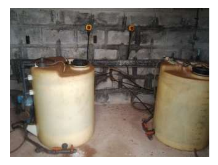
Figure 4: Chlorination chamber

The result from the interview and observation show that MH and S.D.A. shares the same sedimentation pool geographically on longitude 2°10'W-2°30'W and latitude 7°05'N-7°20'N which is physically located behind Getfund hotel of the Sunyani Polytechnic. However, both Municipal Hospital and the S.D.A Hospital do not have a sewage treatment plant and as a result there is no pre-treatment of their liquid waste. They have contracted private companies such as Zoom Lion Company Ghana Limited and Alhaji Awudu Issaka waste management to dislodge the liquid waste to be disposed off into sedimentation pool owned by the municipality for land treatment or natural treatment.