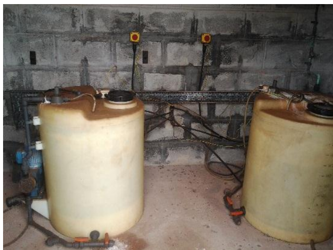
Figure 4: Chlorination chamber

The result from the interview and observation show that MH and S.D.A. shares the same sedimentation pool geographically on longitude 2^{\circ}10'W - 2^{\circ}30'W and latitude 7^{\circ}05'N - 7^{\circ}20'N which is physically located behind Getfund hotel of the Sunyani Polytechnic. However, both Municipal Hospital and the S.D.A Hospital do not have a sewage treatment plant and as a result there is no pre-treatment of their liquid waste. They have contracted private companies such as Zoom Lion Company Ghana Limited and Alhaji Awudu Issaka waste management to dislodge the liquid waste to be disposed off into sedimentation pool owned by the municipality for land treatment or natural treatment.