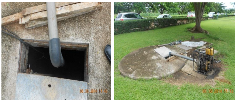
(a) Open anthwart pit

The liquid waste is internally transported through pipes buried in the ground from the hospitals departments by gravity into the temporary storage area called the anthwart pit as shown in Figure 2. The anthwart size varies across the three hospitals. The grey water from the kitchen and laundry are transported through open drain directly into the storm drains. The study results revealed the mode of liquid waste collection is similar among the two of the hospitals namely MH and S.D.A. At the temporary storage area, The MH and S.D.A hospitals liquid waste collection from the ‘anthwart pit’ are dislodged by private company called Zoom lion Ghana Limited whilst at RH, the liquid waste from the anthwart pit is pump into a chamber where further screening is done to any other solid material before finally channeled into the sedimentation tank for treatment. RH has two sedimentation tanks whilst MH and S.D.A has one each of the sedimentation pool. At RH, the clinical waste from the anthwart pit is pumped into a chamber where further screening is done to remove floating and any other settleable solid material found before the clinical liquid is pump into the sedimentation tank for treatment.