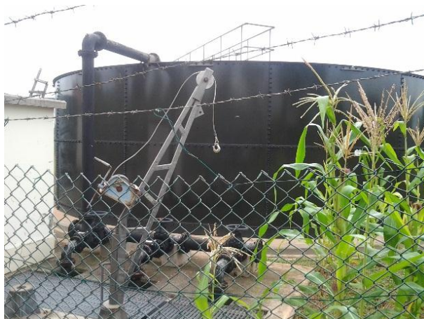
Figure 3: First stage of sedimentation tank

for any bacteria present and left over for a day and more before discharged into a tunnel joined to a stream.