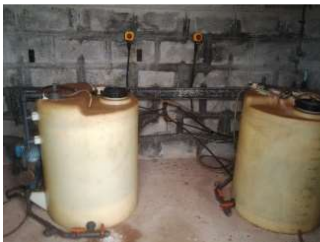
Figure 4: Chlorination chamber

The result from the interview and observation show that MH and S.D.A. shares the same sedimentation pool geographically on longitude 2^{\circ}10'W - 2^{\circ}30'W and latitude 7^{\circ}05'N - 7^{\circ}20'N which is physically located behind Getfund hotel of the Sunyani Polytechnic. However, both Municipal Hospital and the S.D.A Hospital do not have a sewage treatment plant and as a result there is no pre-treatment of their liquid waste. They have contracted private companies such as Zoom Lion Company Ghana Limited and Alhaji Awudu Issaka waste management to dislodge the liquid waste to be disposed off into sedimentation pool owned by the municipality for land treatment or natural treatment.