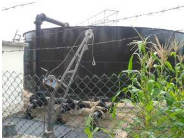
Figure 3: First stage of sedimentation tank