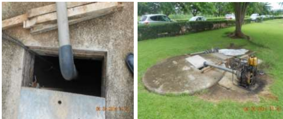
(a) Open anthwart pit

revealed the mode of liquid waste collection is similar among the two of the hospitals namely MH and S.D.A. At the temporary storage area, The MH and S.D.A hospitals liquid waste collection from the 'anthwart pit' are dislodged by private company called Zoom lion Ghana Limited whilst at RH, the liquid waste from the anthwart pit is pump into a chamber where further screening is done to any other solid material before finally channeled into the sedimentation tank for treatment. RH has two sedimentation tanks whilst MH and S.D.A has one each of the sedimentation pool. At RH, the clinical waste from the anthwart pit is pumped into a chamber where further screening is done to remove floating and any other settleable solid material found before the clinical liquid is pump into the sedimentation tank for treatment.