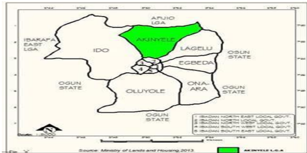
Figure 2: Map of Ibadan metropolis showing its 11 Local Govt Areas.