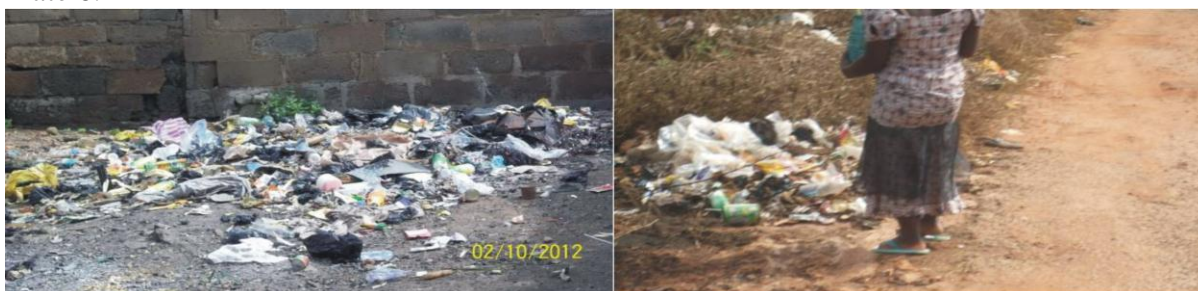
Plate 6: Indiscriminate disposal of solid wastes in open spaces in the study area

About 67.03% of respondents dispose their wastes in open space (dump sites) while 32.97% burn theirs. The modern system of waste disposal by the Waste Management Authority is yet to be embraced in the area. This reveals the primitive method used in the area as shown in Plate 6.