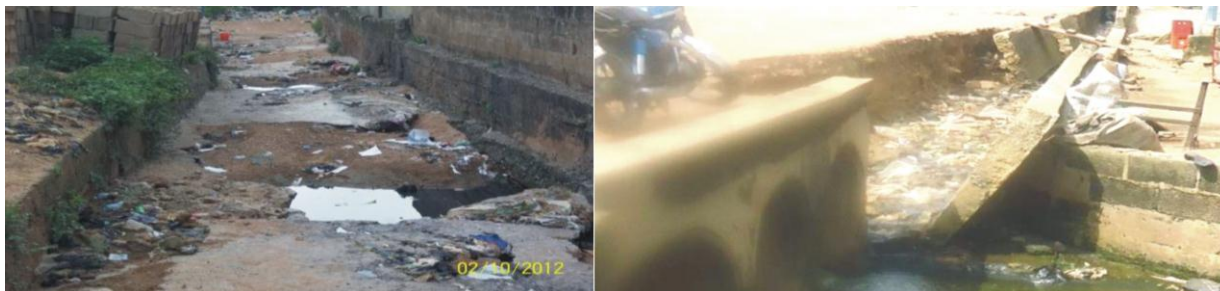
Plate 5: Showing dilapidated & damaged drainage System in the study area

Investigation on drainage condition reveals that 60.44% is in a very poor condition, 21.98% is in a poor condition and the remaining 17.58% is in average condition. This implies therefore that the condition of drainage system in the environment is generally very poor as shown in Plate 5.