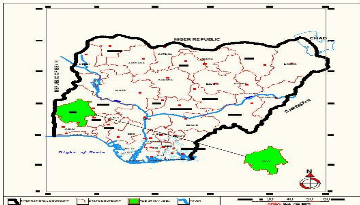
Figure 1: Map of Nigeria Showing Oyo State

The city of Ibadan is known to be the third largest metropolitan area in Nigeria after Lagos and Kano. This is because it is one of the fastest urbanizing cities in Nigeria. The increase in urbanization is attributed to the provision of better economic opportunities due to setting up of factories and industries, which has led to migration of population from rural regions to the city. As a result, people spread to the peripheral areas of the urban fringes. This spread is not properly planned; it looks haphazard thereby causing a lot of health and environmental disturbances to the community. The most versatile land use in Moniya is purely residential. However, few pieces of land were found scattered around the area on which crops are cultivated as secondary means of livelihood for the residence.