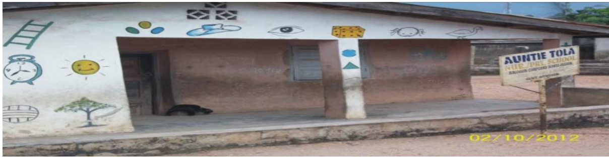
Plate 7: Condition of Educational Facility in the study area