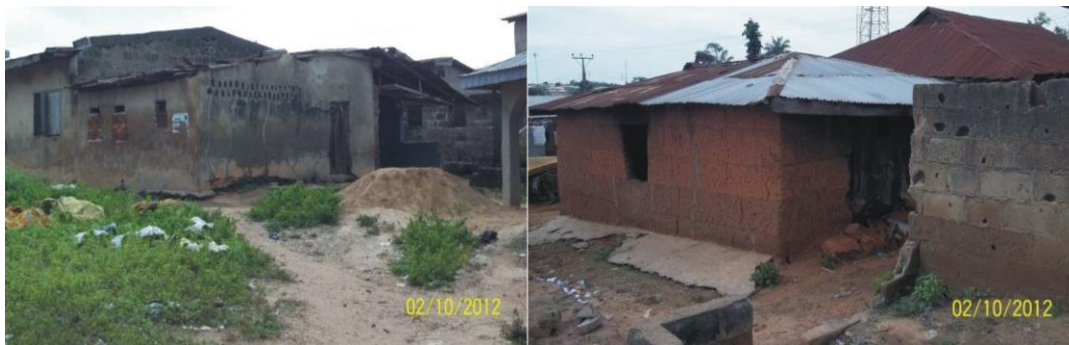
Plate 2a: Typical Housing and Environmental Condition in the study area.