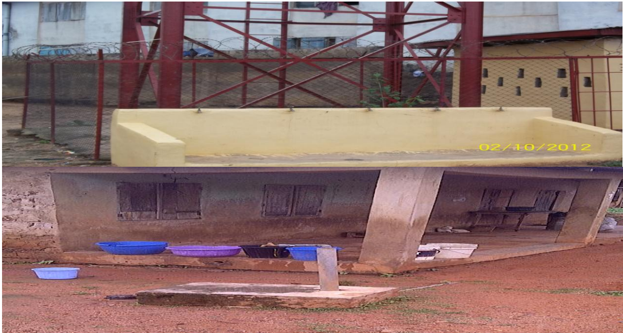
Plate 3a: An uncovered hand-dug well.