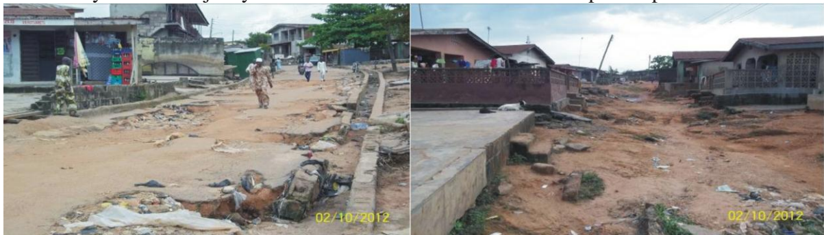
Plate 8: Condition of Access roads in the study area

Road accesses to buildings in the area are mainly through footpath as revealed by 71.43% respondents while only 28.57% access their buildings by road. The conditions of these roads are in sorry state as majority of them are not motor-able. See examples in plate 8.