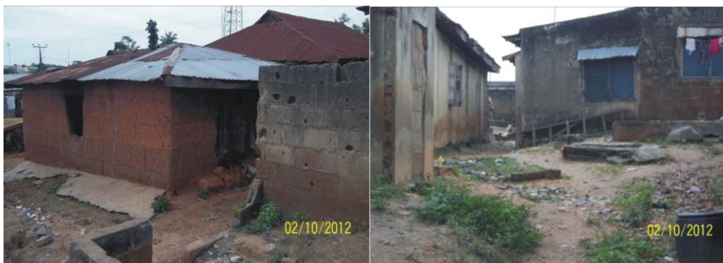
Plate 1: Archetypal example of buildings predominant in the study area.