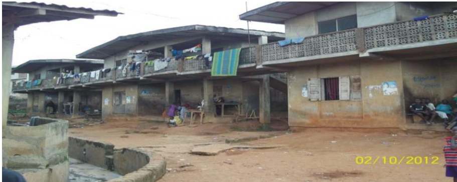
Plate 2b: Showing Buildings without setback in the study area.