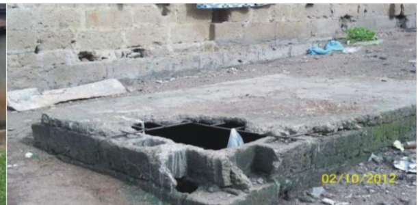
Plate 4b: Showing dilapidated Septic Tank