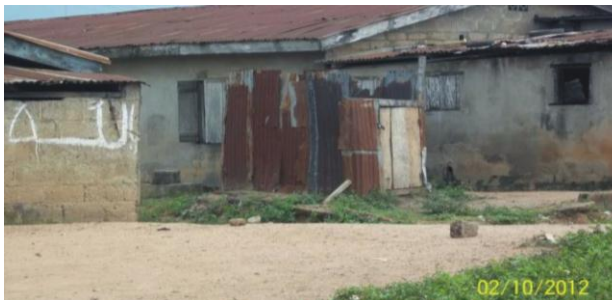
Plate 4a: External pit toilet and bathroom

About 62.24% use pit latrine in their homes, 32.78% use aqua privy while 8.9% use water closet. This shows that the use of pit latrine is dominant in the study area. Plate 4a and 4b show a typical example of this primitive method used for faecal waste disposal, the condition of septic tank of most of the WC system and types of bathroom facility predominantly used in the area.