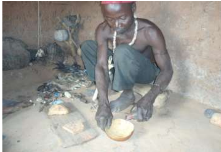
Figure 3: A community soothsayer (Vooru)

When the researchers inquired to know from this soothsayer how he was able to confirm that a particular child was not a human but a Chuchuru , he replied by saying the gods never lie.