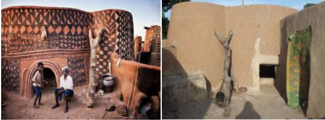
Figure 5 (a)