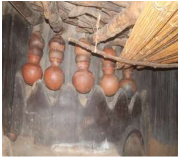
Figure 7: The Saara (local mat) hang to the right used to carry Chuchuru for burial