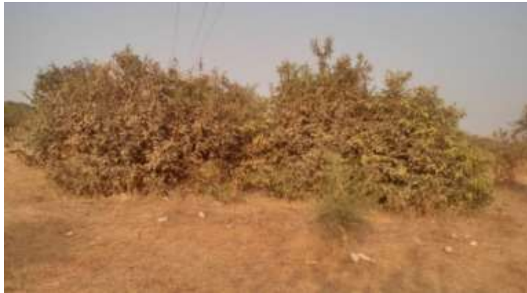
Figure 2: Kikantuoa (The Chuchuru Shrub or Grove)