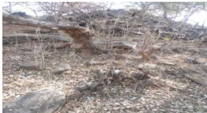
Figure 1: Chuchuru Pio (Mountain of Chuchuru )

Another fetish priest pointed out that, some other ways the Chuchuru could enter a house included the following: eating while walking in the bush, having sex in the bush, women standing to urinate and also easing one’s self in certain places not allowed as buttressed by Daly and Wilson (2001). The easiest way for a spirit to accomplish its goal of passing from the bush into domestic space is to enter a woman through sexual activity. Sex outside of the house would attract a Chuchuru spirit to enter the woman. It is believed that if a spirit is passing by while you are having sex outside of the house (it can enter you) immediately when you finish, or just before you start. That is why it’s advisable for men not to have intercourse with a woman outside the house. The location and method used to urinate is also of concern. Women are discouraged from relieving themselves in prohibited places, such as where spirit children are buried, and in other locations identified as spiritually dangerous, liminal, or ambiguous. Community members also describe that eating while walking is a common way for a woman to attract a spirit of Chuchuru .