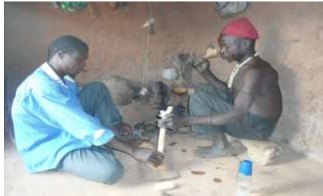
Figure 4: A father with a Chuchuru child consulting the soothsayer.