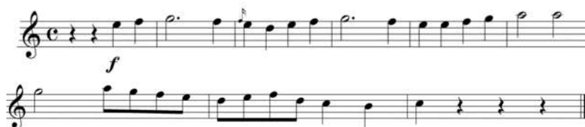
Example 6. Flute, Bassoon and Harpsichord Sonata in C Major, Second Movement, Bassoon Solo